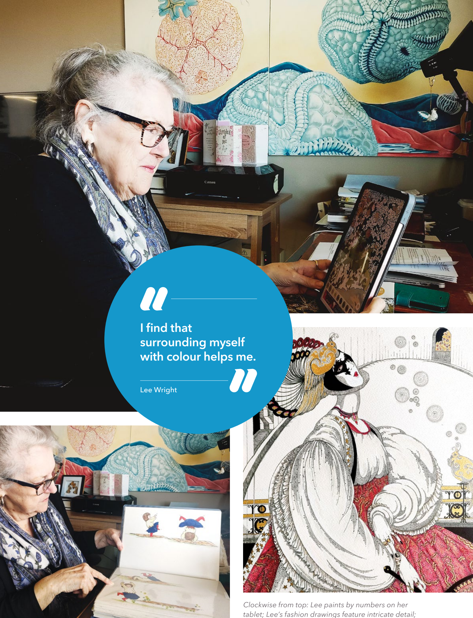
tablet; Lee's fashion drawings feature intricate detail; Illustrations from Lee's children's book.