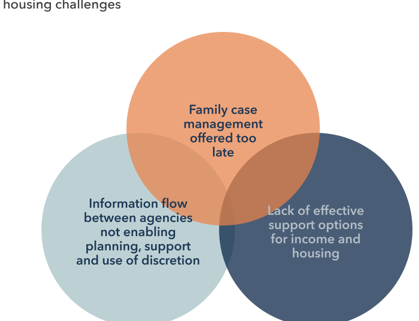
FIGURE 4: Service provision responses to families' income and housing challenges

Service providers in government agencies and in the community sector reported that when information was shared between CSS, Housing Tasmania and Centrelink, it often led to positive outcomes for clients, whether it be allocating public housing with sufficient space for reunification due to Case and Care Plans being shared between CSS and Housing Tasmania; or Centrelink clients successfully obtaining a job search exemption from Centrelink while they focused on reunifying with their child, due to CSS providing evidence of actions parents were required to undertake. But although these processes worked, they were not routinely undertaken. Lack of communication between agencies often had catastrophic impacts for parents and family reunification: delays to parenting income being removed or returned leading to an intensity of poverty-induced stress, or parents languishing on the Social and Affordable Housing Register with no hope of an affordable housing solution to support their family to reunify.